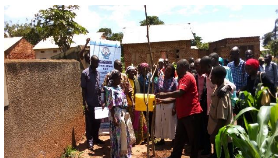
AVHT coordinator demonstrating on how to make a local wash hand facility at the toilet

KADO organized 3 WASH campaigns in each of the 8 lower local governments. KADO facilitated trained VHTs, clan leaders and youth leaders to work with government extension workers (Parish Chiefs, Health Assistants, Community Development Officers and Health Assistants) in each of the 8 Lower Local Governments to expedite the promotion campaigns at community level. There was demonstrations at selected homes after which other household heads was supported to replicate. Attention was directed towards improving community water sources, safe water chain in the home, improving home sanitation and hygiene. KADO has names of household heads that will meet set criteria recognized in village, Parish, Sub-County /Division and district councils for others to enumerate.