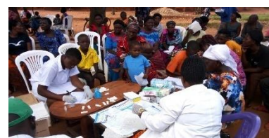
A health worker testing people during the integrated outreach

KADO worked together with the Community Health Workers, clan leaders and religious leaders supported government extension workers (Parish Chiefs, Health Assistants, Community Development Officers) to mobilize targeted community members to attend 2 integrated health out reaches/camps in each sub-county/division of focus, so as to provide a range of health services provided by health workers. Hot spot areas were mapped and outreaches organized targeting about 100 people per outreach that include boda-boda riders, youth out of school, female sex workers, truck drivers.